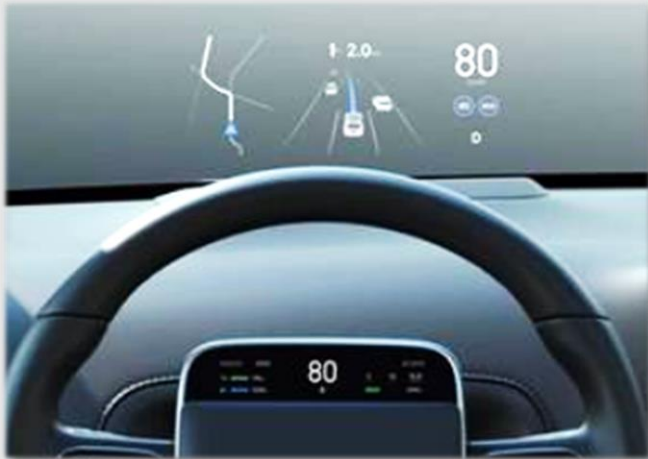
Head-up Display, HUD